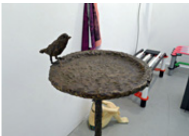
Ugo Rondinone, Hurry up! I'm dreaming , 2011, Cumulus Studios, New York