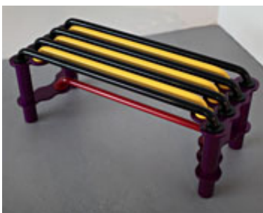
Jim Drain, Untitled (bench) , 2011, Cumulus Studios, New York